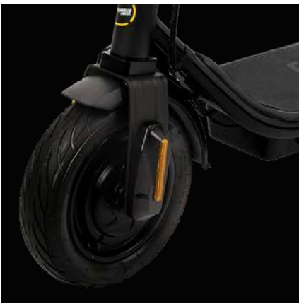
10" Street tubeless tyres