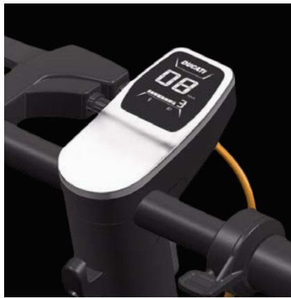
Integrated LED display