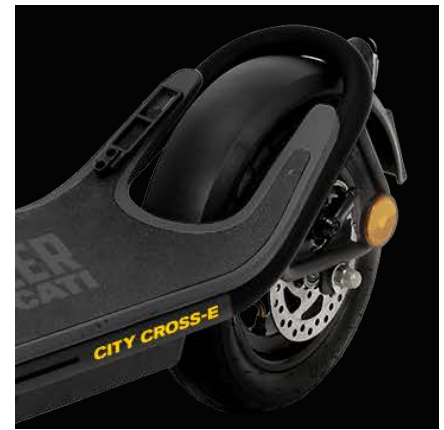
Rear disc brake